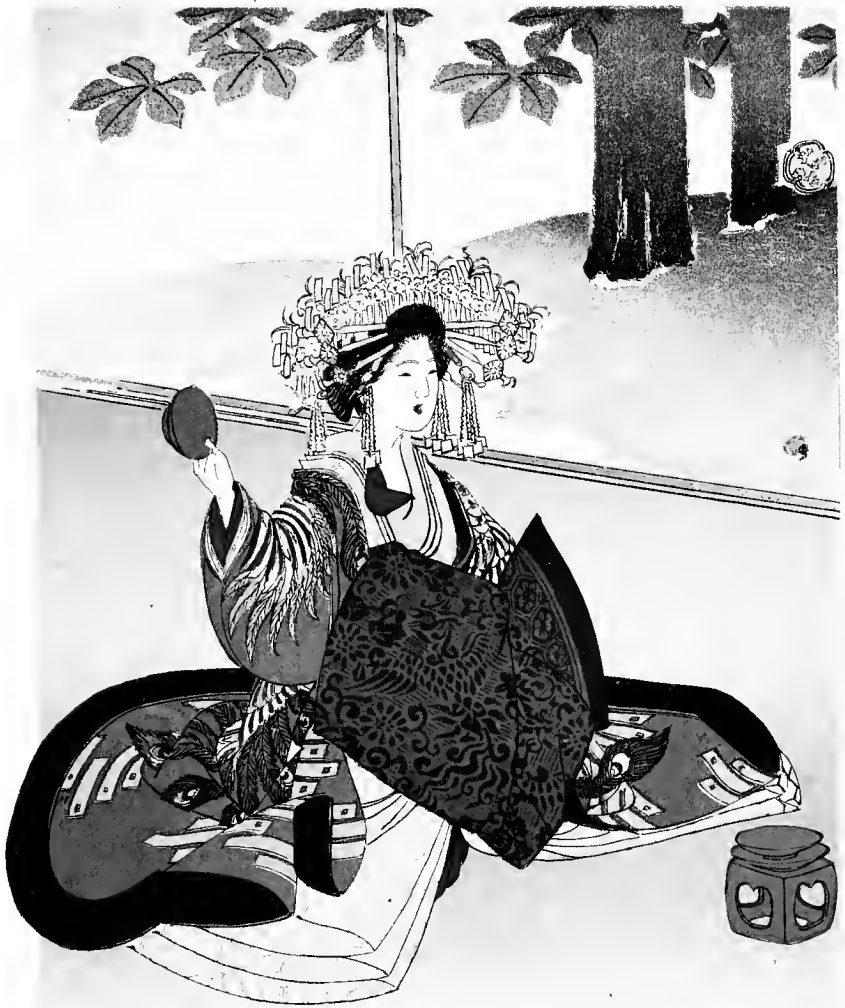
The Taiyu waves her saké-cup .